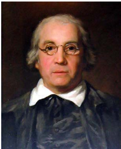
Portrait of David Hartley

I understand that your ancestor, 'Jack O'Newbury' is something of a folk hero in the local area. You are also closely related to Lord Bolingbroke, who tried to return the Jacobites to power, and to David Hartley, who, with his friend Benjamin Franklin, drew up the peace treaty between Britain and the US at the end of the American Revolution. How do you feel about having such distinguished ancestry?